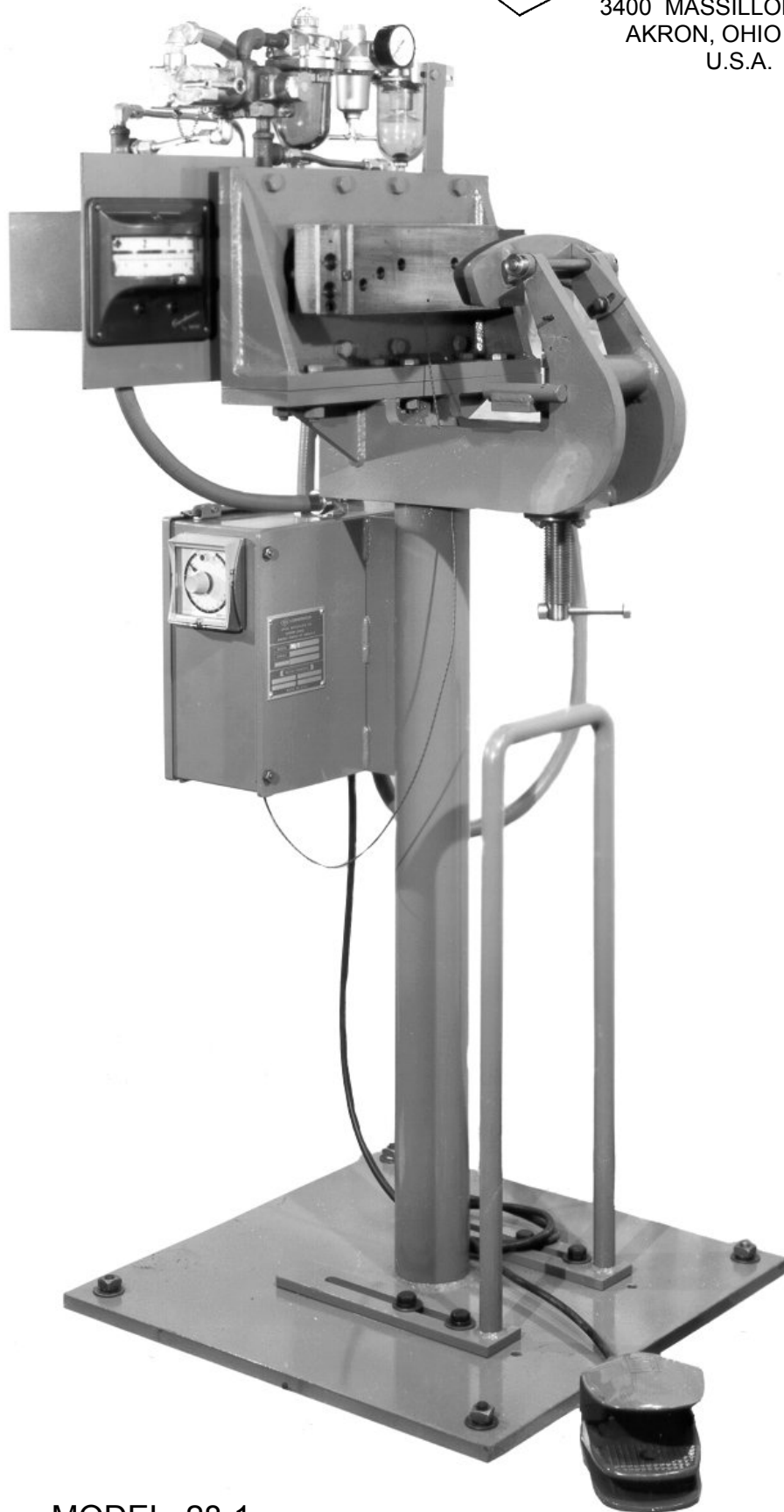
MODEL 28-1 PASSENGER TIRE BRANDER