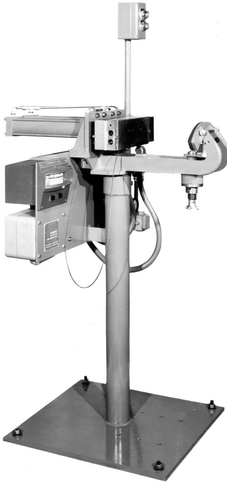
MODEL 161 INDUSTRIAL TIRE BRANDER

R/S CORPORATION 3400 MASSILLON ROAD AKRON, OHIO 44312 U.S.A.