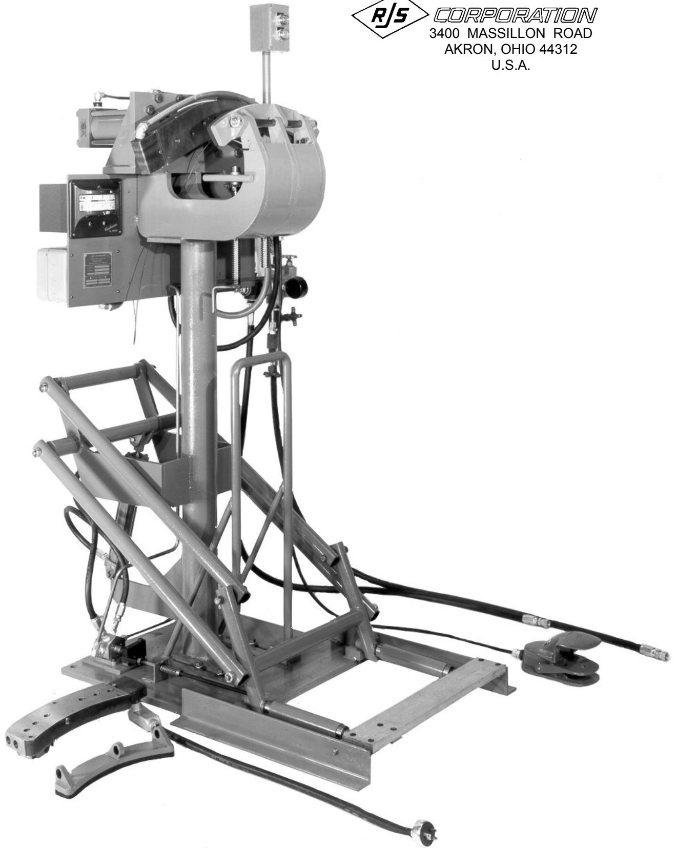
MODEL 82 TRUCK TIRE BRANDER WITH LIFT

R/S CORPORATION 3400 MASSILLON ROAD AKRON, OHIO 44312 U.S.A.