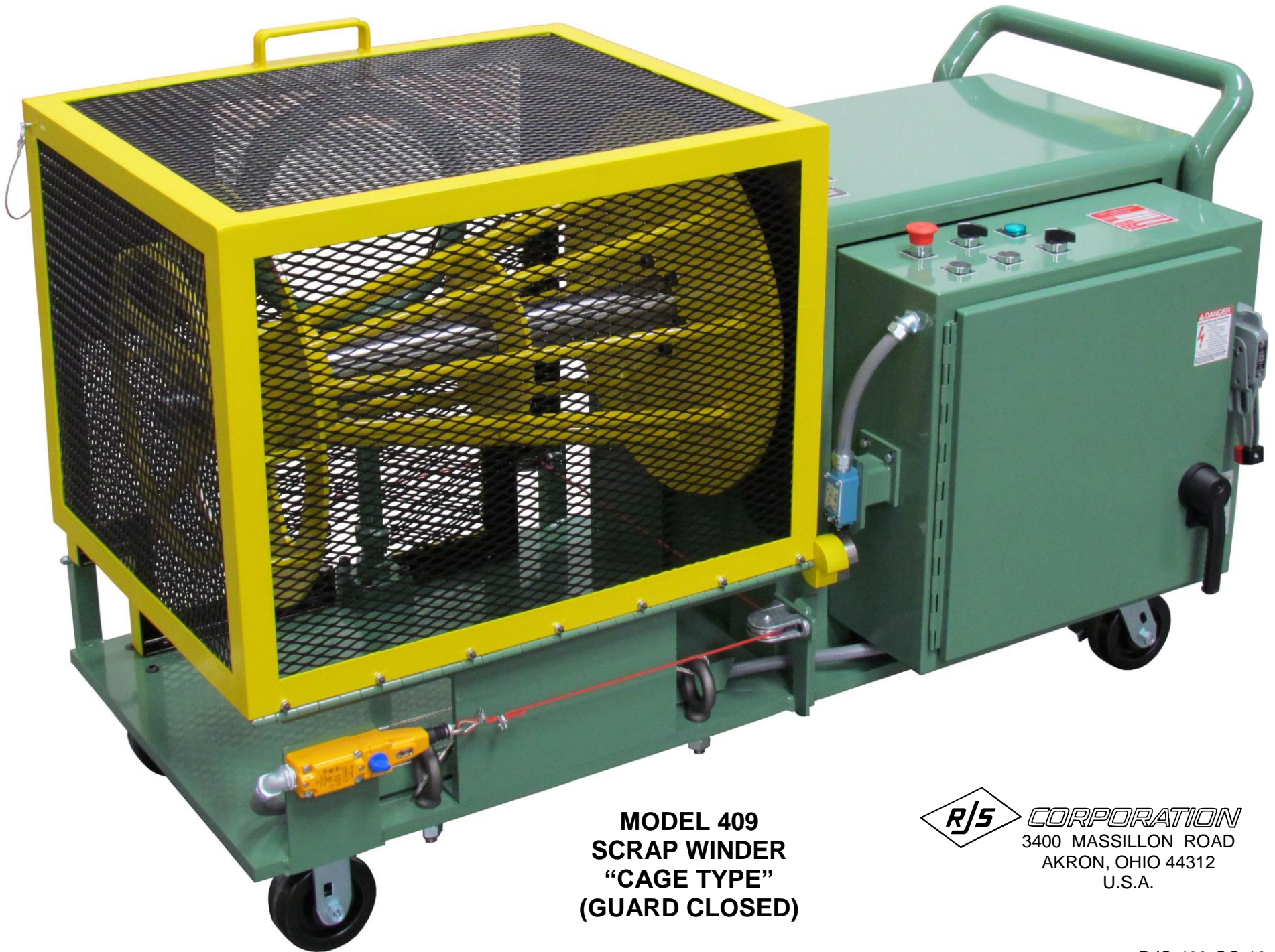
MODEL 409 SCRAP WINDER "CAGE TYPE" (GUARD CLOSED)

R/S CORPORATION 3400 MASSILLON ROAD AKRON, OHIO 44312 U.S.A.