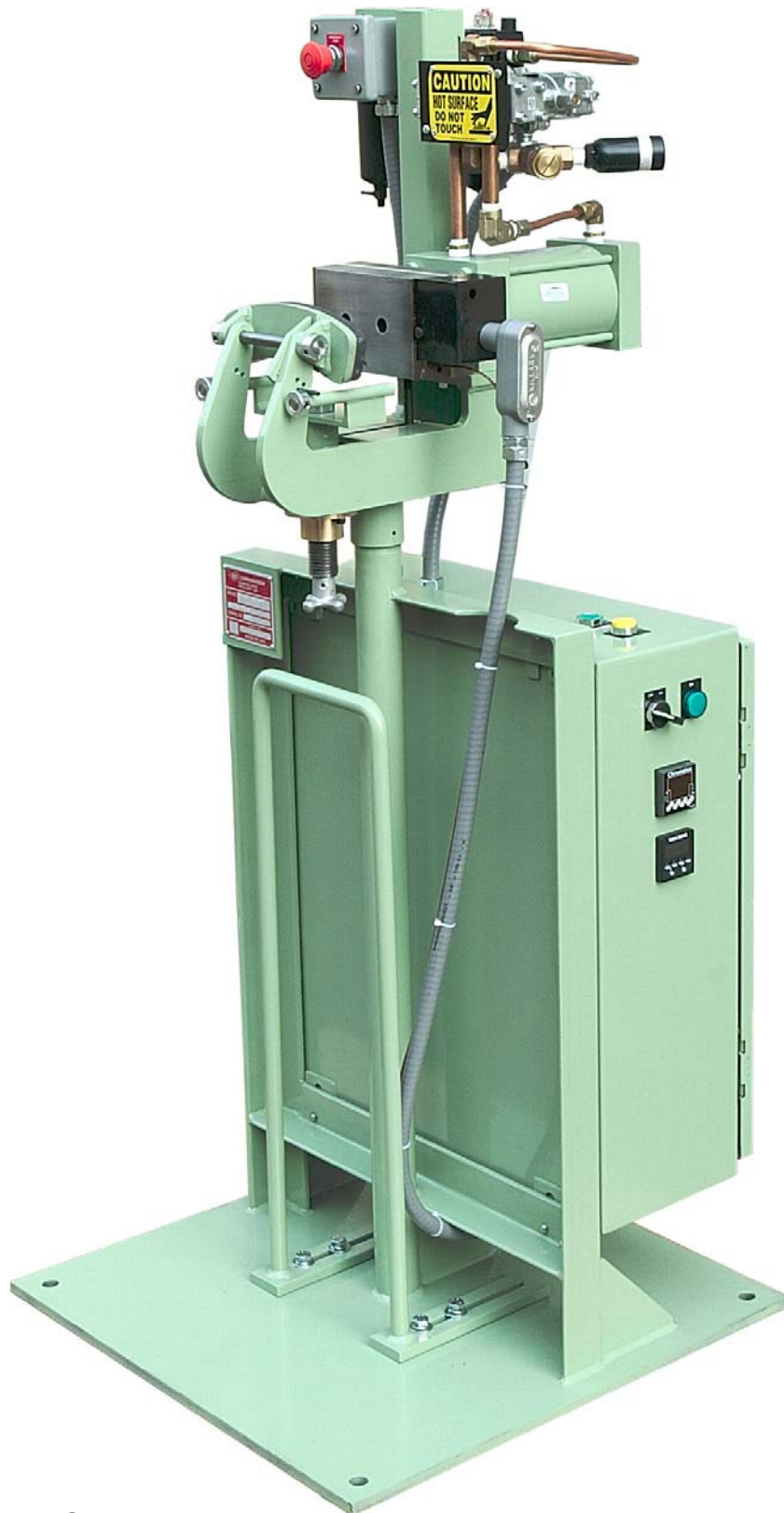
MODEL 79 MINI-BRANDER