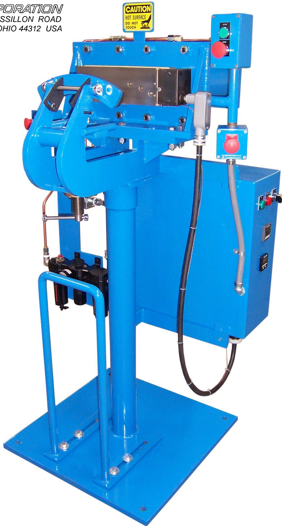
MODEL 28-1 PASSENGER TIRE BRANDER