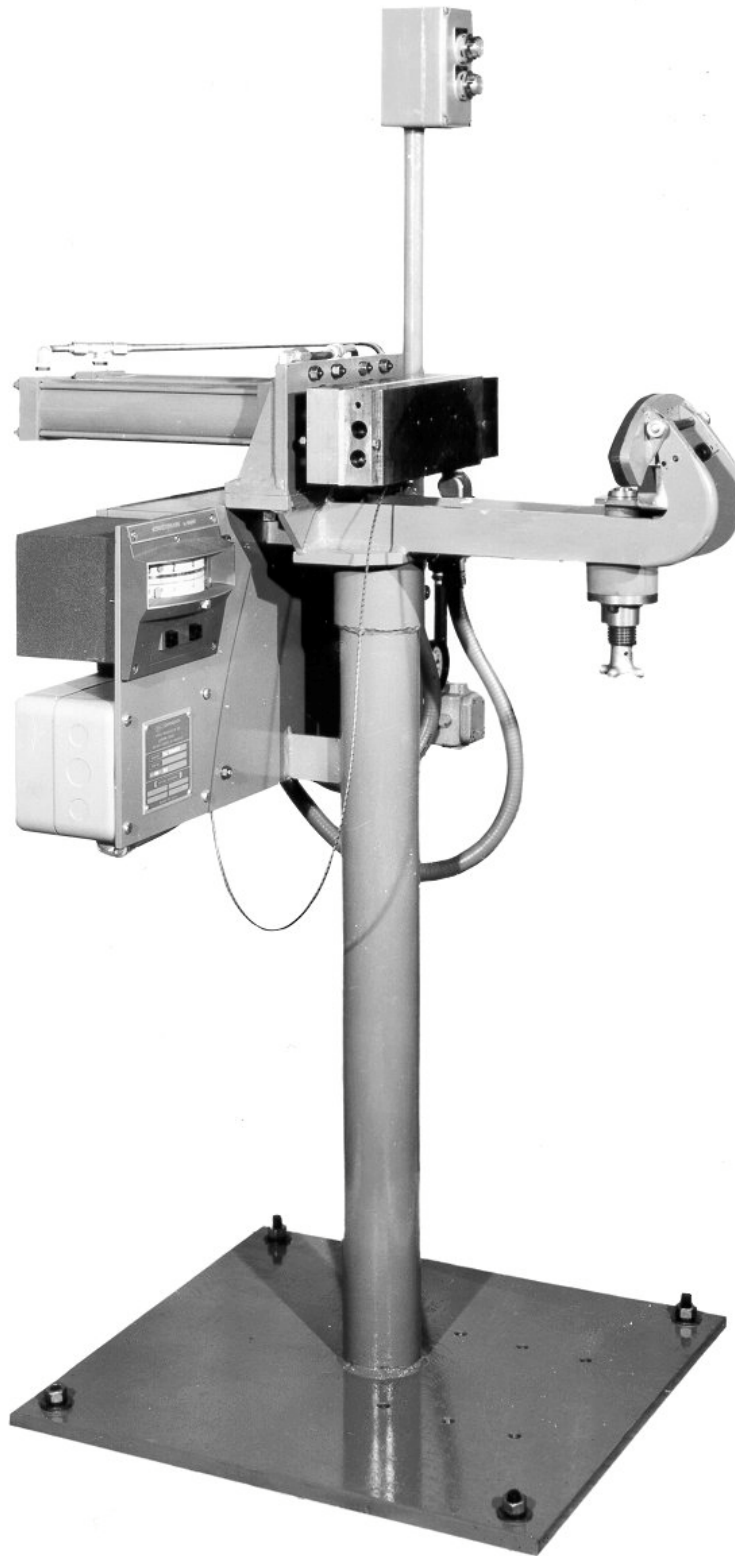
MODEL 161 INDUSTRIAL TIRE BRANDER