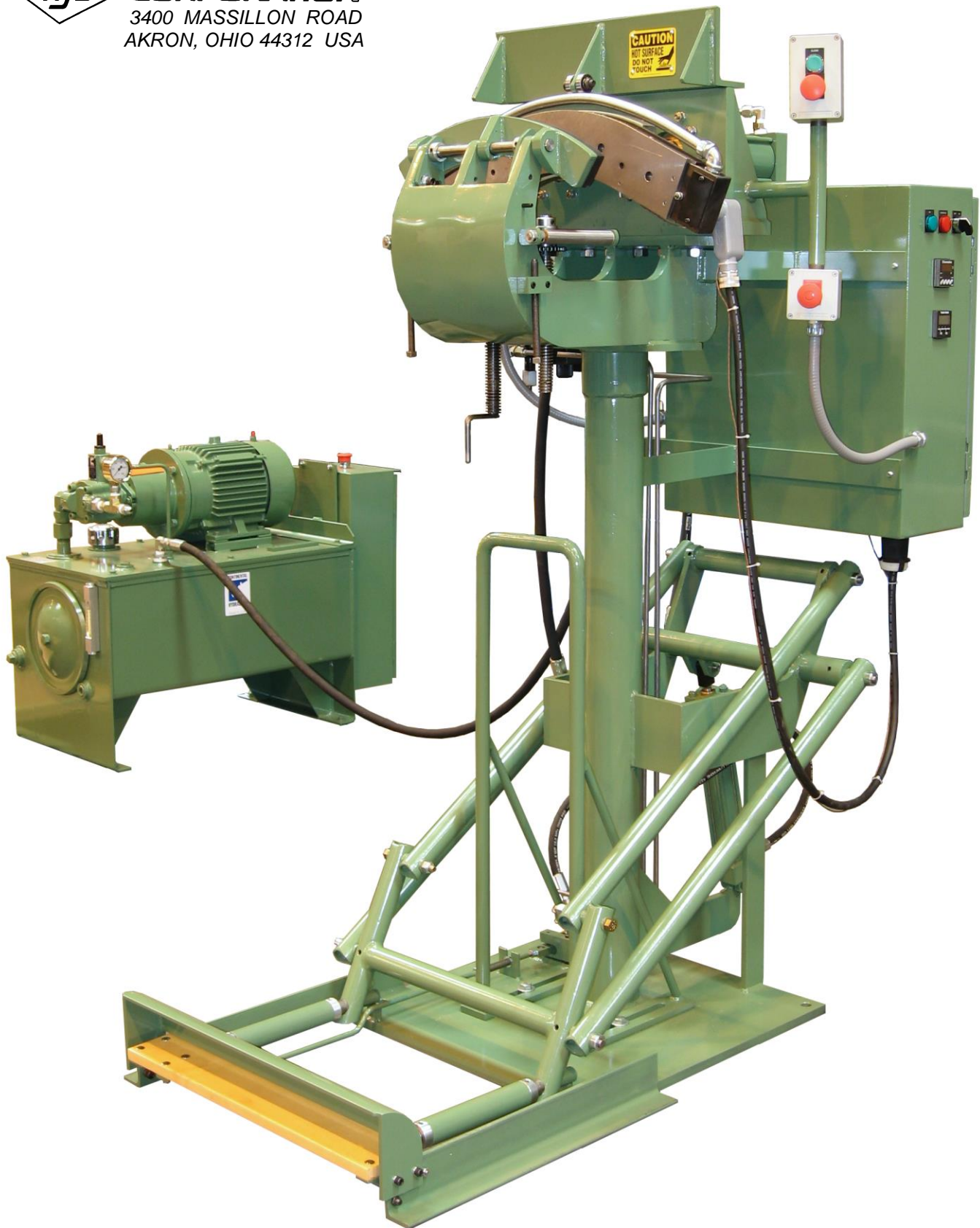
MODEL 82 TRUCK TIRE BRANDER WITH LIFT with HYDRAULIC PRESSURE UNIT